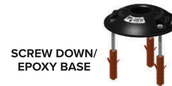
SCREW DOWN/ EPOXY BASE