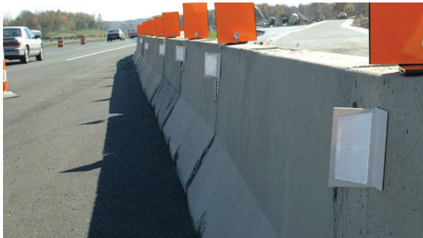
BAM Delineator, clear lens, on side, Quik-Mark Object Marker, on top.