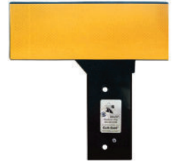
4" x 13" reflective area Delineator "T"