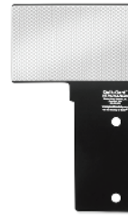
4" x 6½" reflective area Delineator "L"