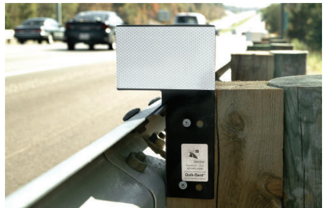
L-type shown above: 4" x 6½" white reflective area.